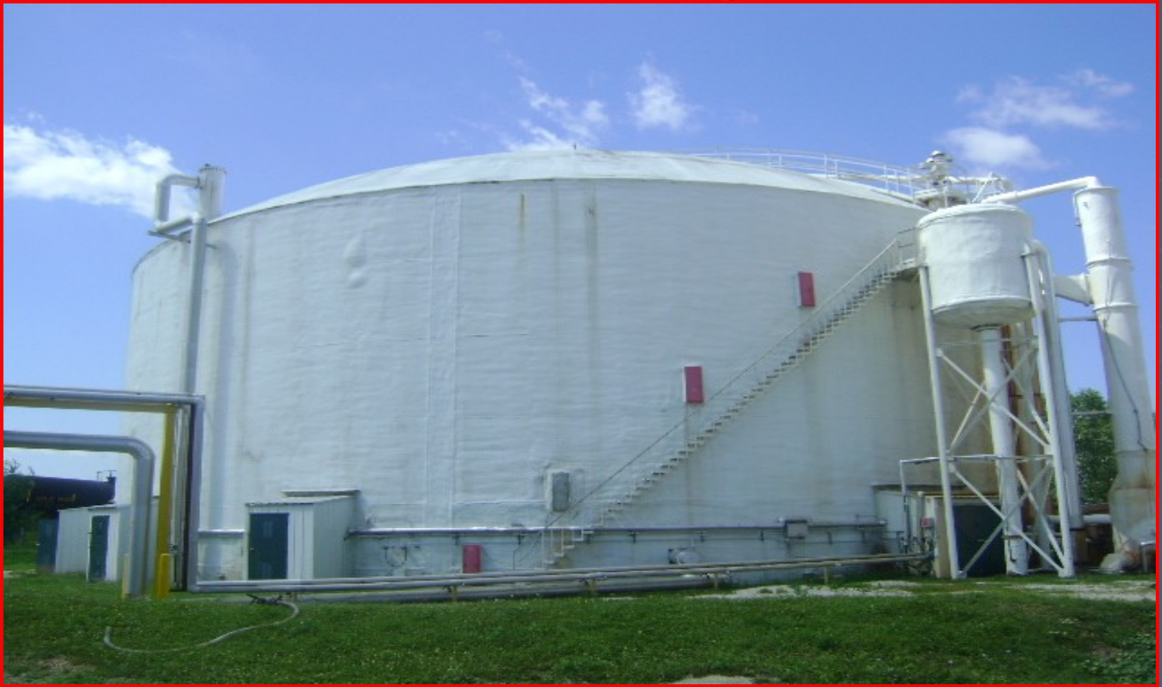
Anaerobic Contact Tank