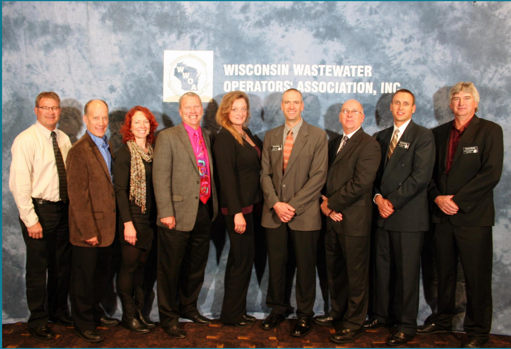
Current Board of Directors