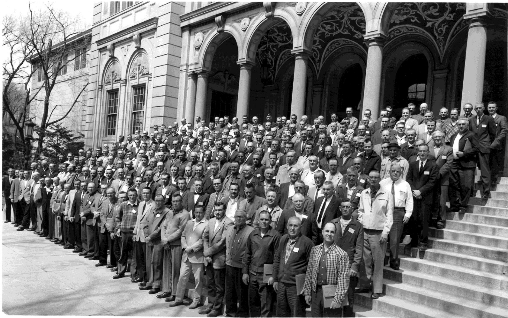
Wisconsin In-Service Short Courses 19th Sewage Works Course — April 20-22, 1965