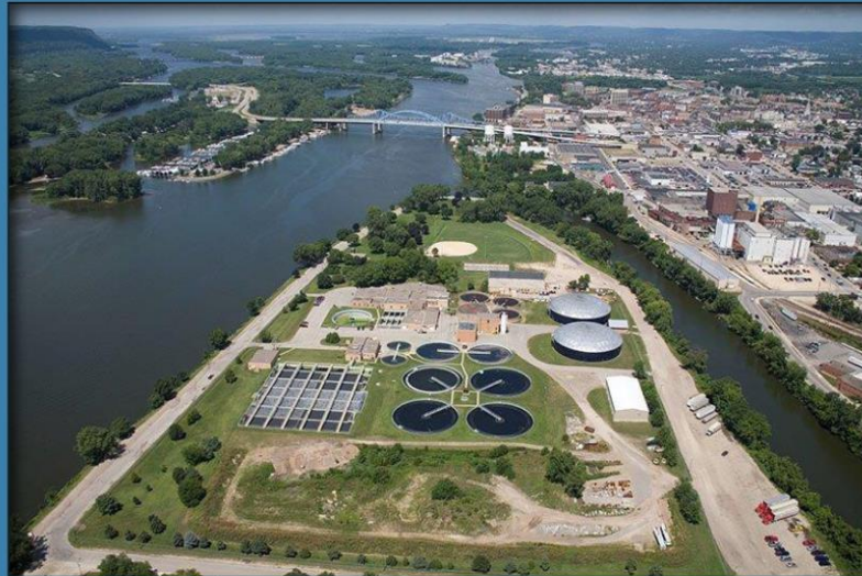
Aerial view of La Crosse Wastewater Treatment Plant