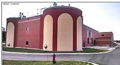
Madison Wastewater Treatment Plant