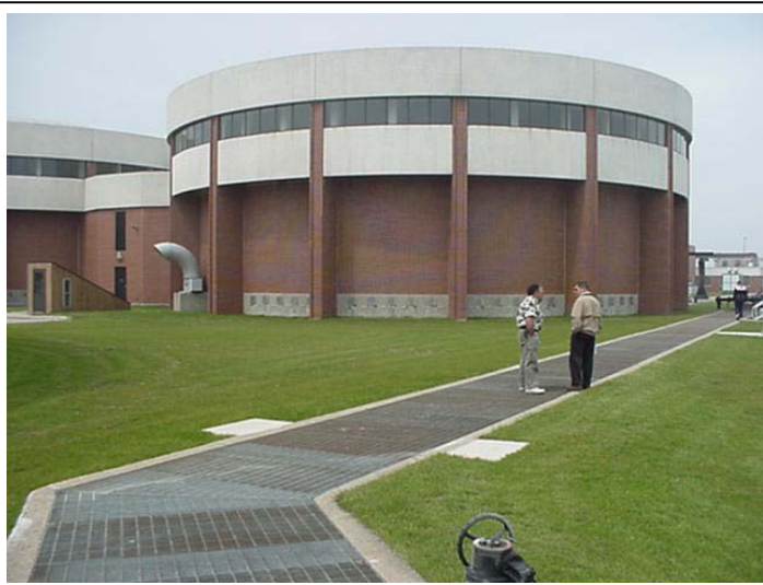
Operators touring the upgraded Manitowoc WWTP. (see page 3 for more photos)

Contact your SE Region officers for more information. June 30 deadline.