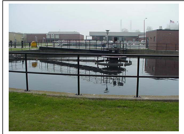
Clarifiers reflect the gray sky.