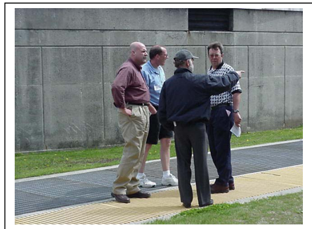
Really, the water flows that way...

We welcome your input and comments!!! This is your region & your webpage! Please contact us with information or questions -