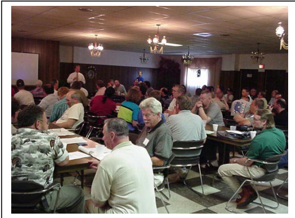
Operators listen to morning presentations.