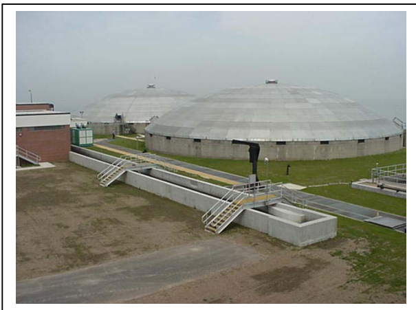
Overview of the plant & foggy Lake Michigan.