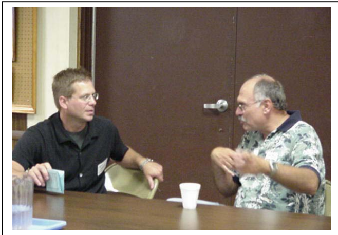
Morning round table discussions continue.