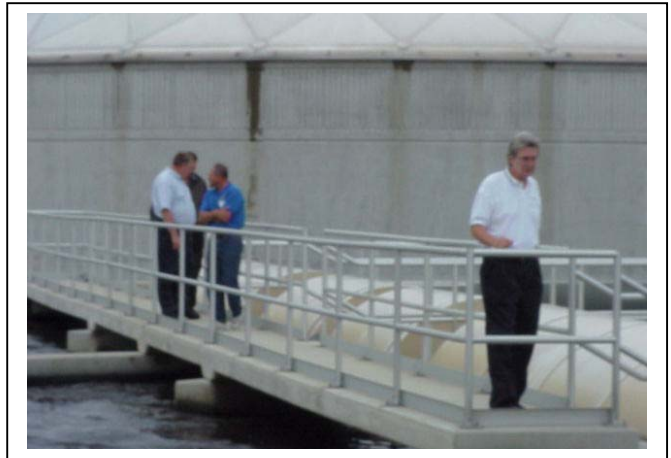
Tour attendees inspect Hartford WWTP.