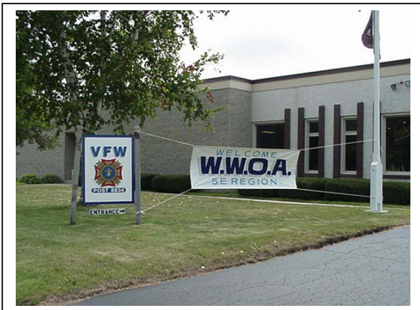
VFW Hall in Hartford, WI – Site for SE Region Meeting and Pig Roast. (see page 3 for more photos)

The competition will take place on Wednesday, October 3, from 12:30-4:30 pm. Let's be sure to cheer on the SE Region team!