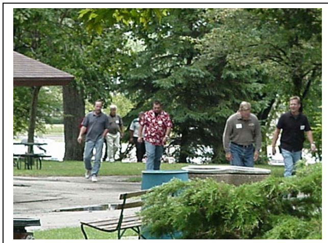
Hungry operators arrive at the park.