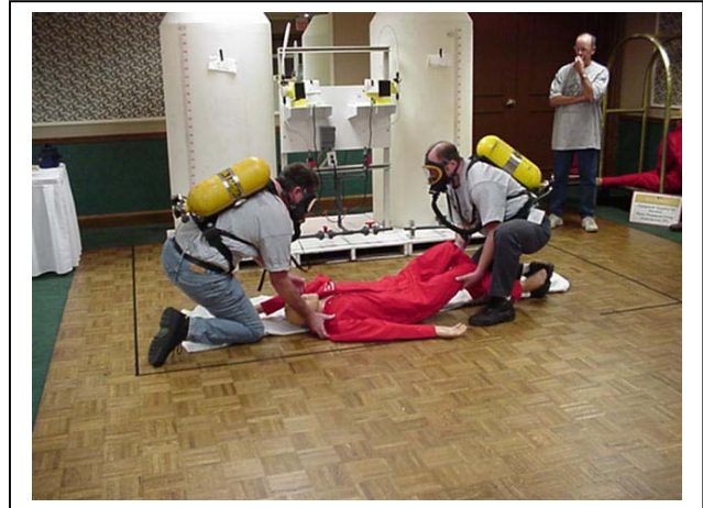
SE Team in action.