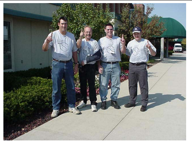
The enthusiastic SE Team prepares for battle.